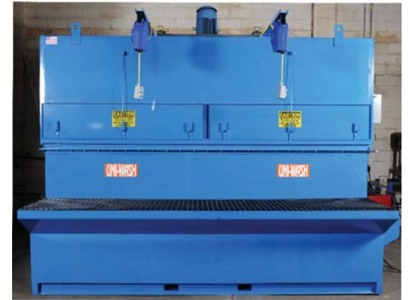
New Model DDB-125 with wider 180" x 30" work surface for multiple station use.

Wet type dust collectors are recommended by the NFPA (National Fire Protection Association) for use in combustible metal applications such as aluminum, titanium, magnesium, and lithium finishing processes.