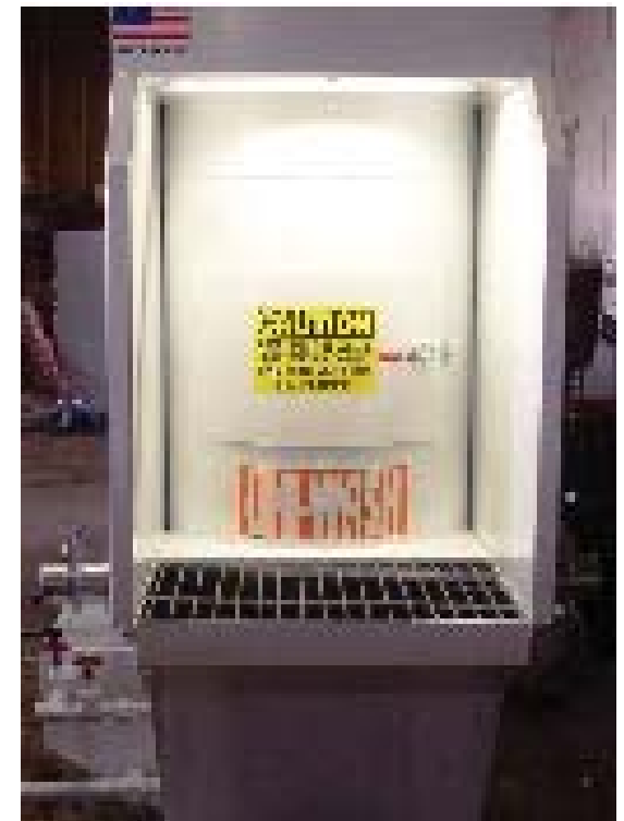
Model DDB-10 with 27" x 18" work surface, shown with light, ceiling, and side panel options.