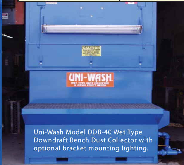
Uni-Wash Model DDB-40 Wet Type Downdraft Bench Dust Collector with optional bracket mounting lighting.