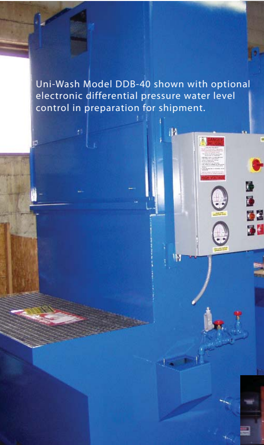
Uni-Wash Model DDB-40 shown with optional electronic differential pressure water level control in preparation for shipment.