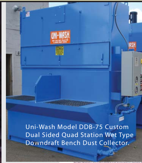
Uni-Wash Model DDB-75 Custom Dual Sided Quad Station Wet Type Downdraft Bench Dust Collector.